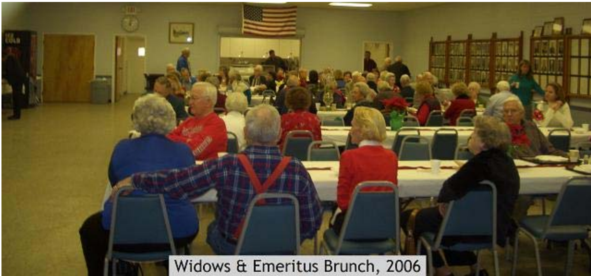
Widows & Emeritus Brunch, 2006